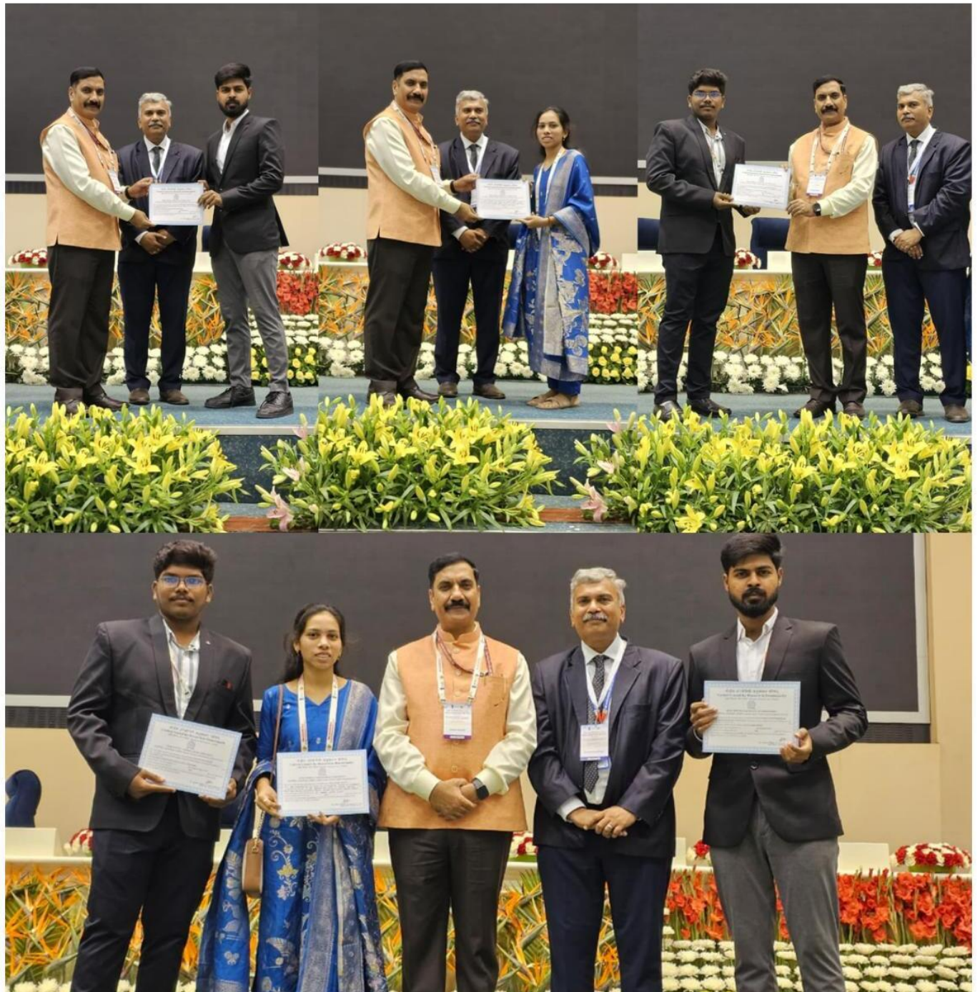
STSH Awards by CCRH, New Delhi — 11th April 2026 | ASRHMC Student Researchers Receiving Appreciation Certificates