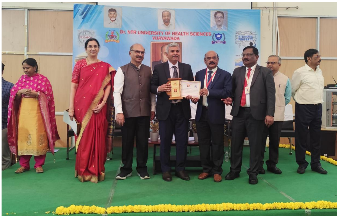
Award Ceremony — Dr. NTR University of Health Sciences, Vijayawada, AP, 2026