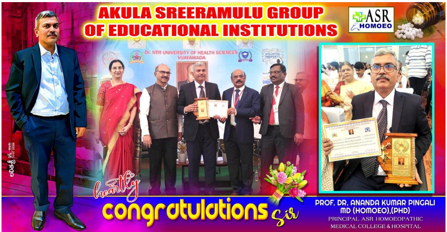
Felicitaton — Akula Sreeramulu Group of Educational Institutions, 2026